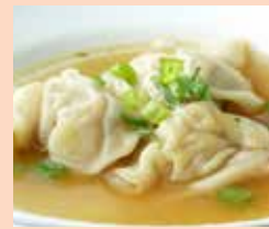
23. Chicken Wonton Soup