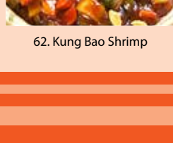
62. Kung Bao Shrimp