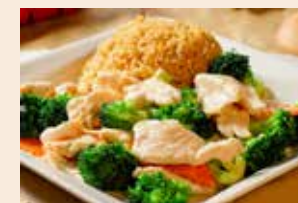
L13. Chicken Broccoli