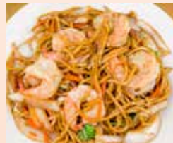
154. Shrimp Lo Mein