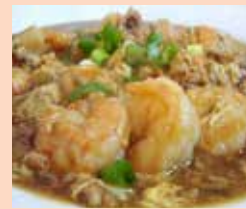
87. Shrimp Lobster Sauce