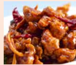
53. Governor's Chicken