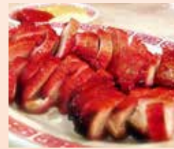
7. Barbecued Pork