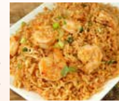
48. Jumbo Shrimp Fried Rice