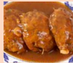
35. Shrimp Egg Foo Young