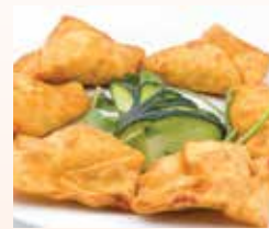
5. Crab Rangoon