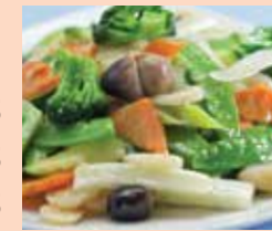
60. Vegetable Delight