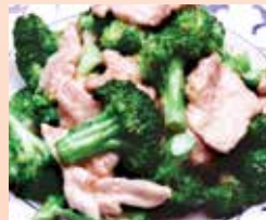
114. Chicken Broccoli