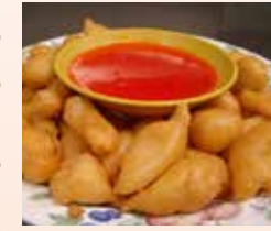
112. Sweet & Sour Chicken