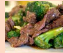
121. Beef Broccoli