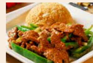
L3. Pepper Beef