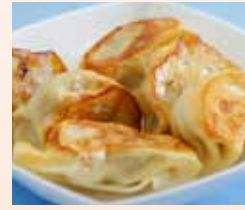
6. Pot Stickers