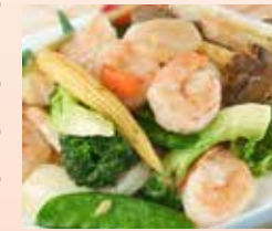
83. Shrimp with Vegetable