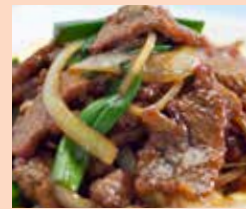
59. Mongolian Beef