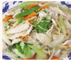
103. Chicken Chop Suey