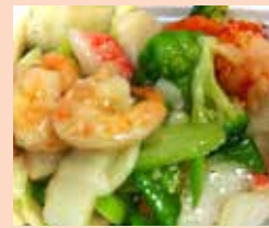
68. Seafood Vegetable