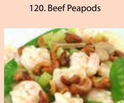
120. Beef Peapods