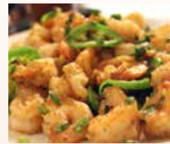
51. Crispy Spicy Shrimp