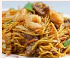
155. Combo Lo Mein