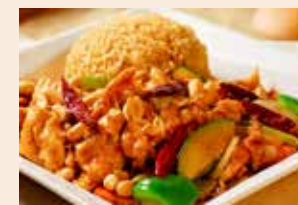
L20. Kung Bao Chicken