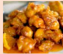
55. Orange Chicken