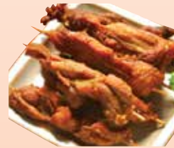
9. Teriyaki Chicken