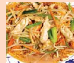
103. Chow Mein with Chicken