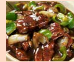
124. Beef with Green Pepper