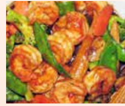
58. Szechuan Shrimp