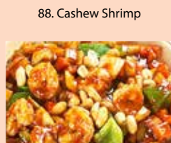
88. Cashew Shrimp