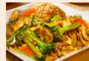
L4. Szechuan Chicken