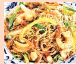
64. Singapore Rice Noodle